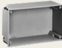
ABB MT701 devices GIRA MT701 devices BERKER MT701 devices JUNG EBG24 devices mounting boxes UP-KAST2