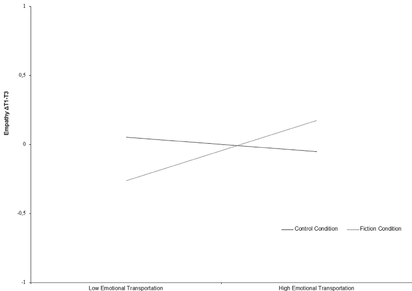
Figure 1. The interaction pattern between emotional transportation and condition in relation to changes in empathy from T1 to T3 (Study 1).

Handelsblad (control condition). After reading the text, they filled out the emotional transportation measure as well as the narrative understanding and attentional focus measures, the empathy scale, and some other irrelevant scales, such as engagement in leisure activities, attitudes about work and creativity, in order to avoid demand characteristics (T2). Furthermore, participants were asked to give a summary of what they had read. The first author and two colleagues assessed whether participants gave accurate summaries. Since all of the participants provided accurate summaries, none of