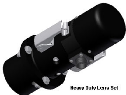
Heavy Duty Lens Set