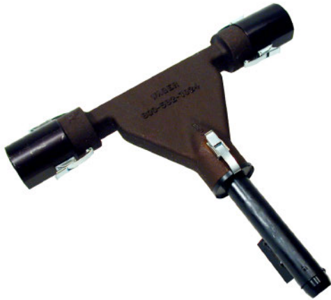
PARTIAL FLOW HEAD