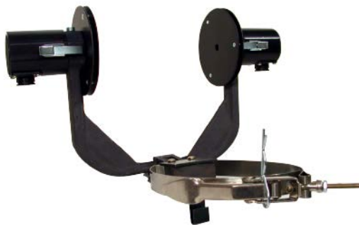
FULL FLOW HEAD

ull flow heads are less susceptible to heat build-up and pressure created by the exhaust during testing.