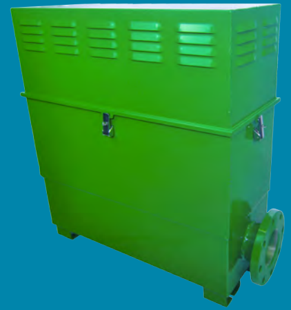
SIDE FLANGE MOUNT AVAILABLE

Each vent has louvered covers to allow for maximum air flow of deodorized air. Every vent is equipped with lockable latches to prevent tampering. Available as a vertical mount, or with a side access.